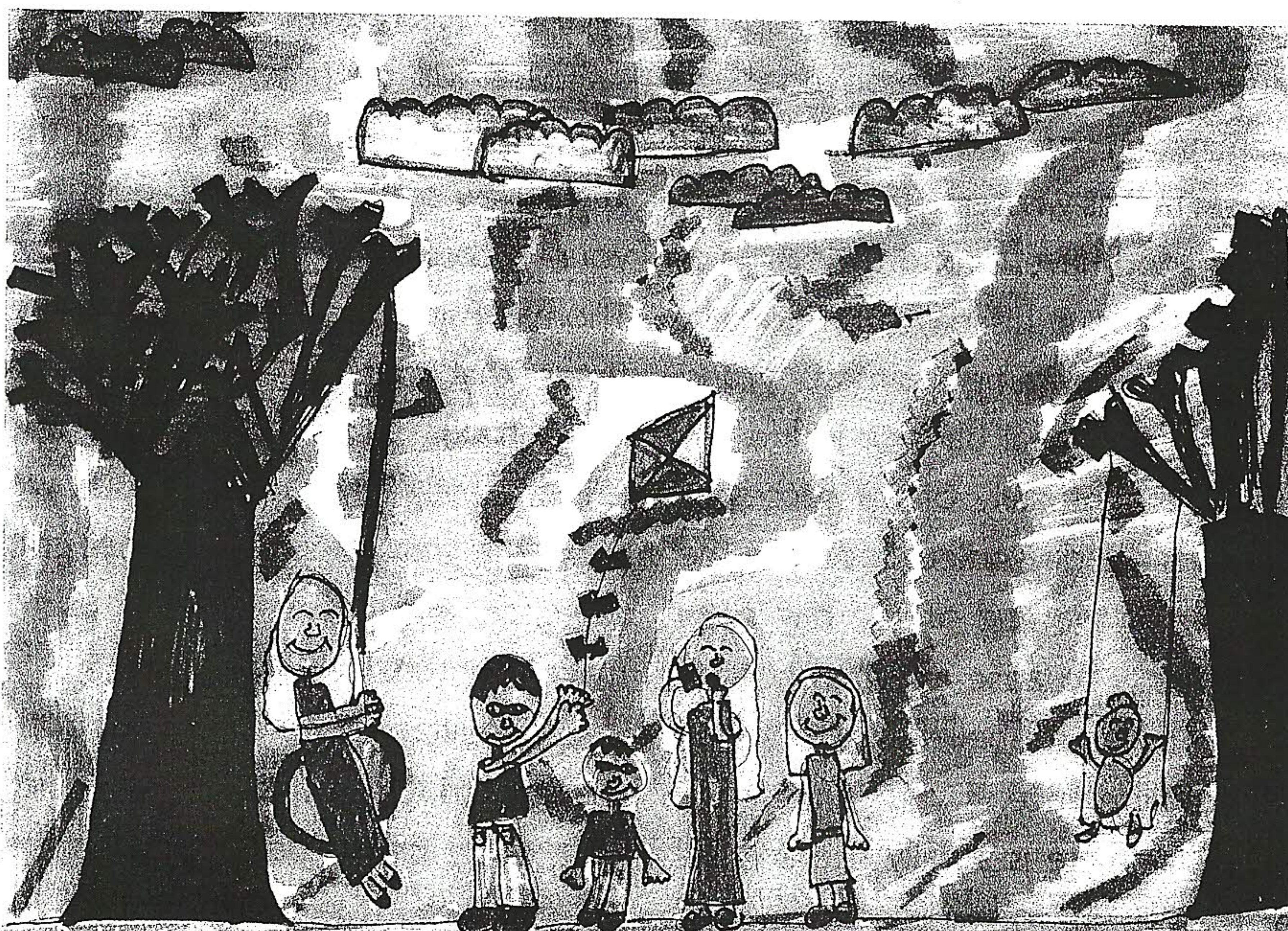
by Megan, Grade 4 • EA White Elementary • Fort Benning, GA

To order a copy at $49.50, either send an invoice to Community Coalition for Children, PO Box 447, East Lyme, CT 06333 or call/email Bank Square Books in Mystic, CT to use your credit card: (860) 536-3795 Banksquarebks@msn.com